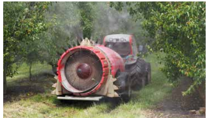
Orchard air-blast application in Victoria

Stroby is registered at 10 g/100 L by dilute spraying and can be used up to a 5X concentration factor (50 g/100 L) for concentrate spraying. A wetting agent is not required but can be used if Stroby is applied with a mixture partner.