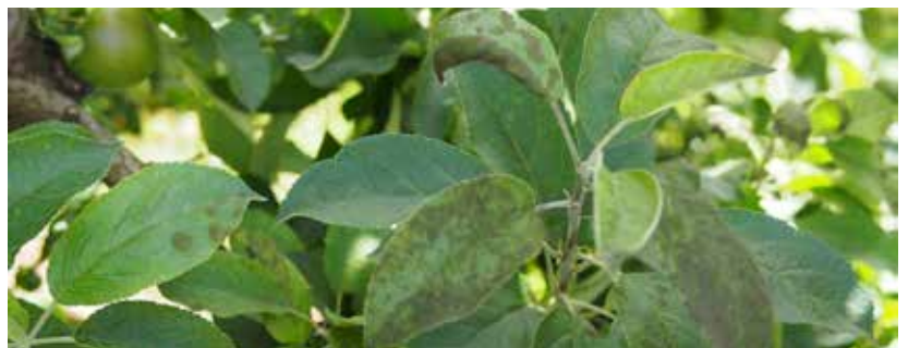
Apple black spot on leaves