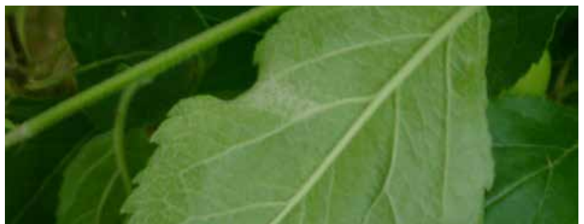
Apple leaf showing early powdery mildew infection