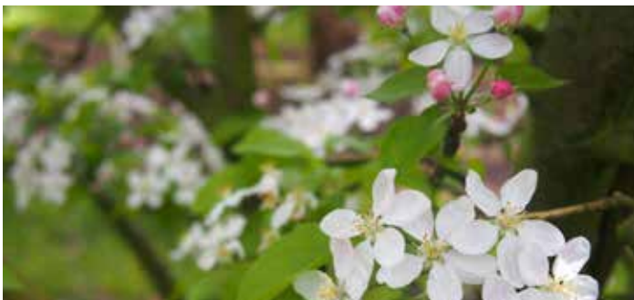
Apple blossom showing pink stage (at top) and full bloom

Stroby is a WG formulation which is easy to mix and measure and does not harm beneficials.