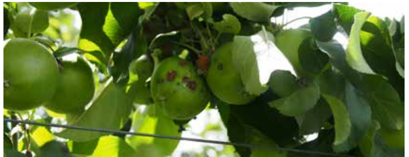
Apple black spot on fruit

Stroby is compatible with Bugmaster*, Insegar*, Pyranica* and Delan*. Since formulations of other manufacturers' products are beyond the control of AgNova Technologies Pty Ltd, all mixtures should be tested prior to mixing commercial quantities. It is recommended that the physical compatibility is tested in a jar test and then small scale crop safety testing is conducted before treating larger areas.