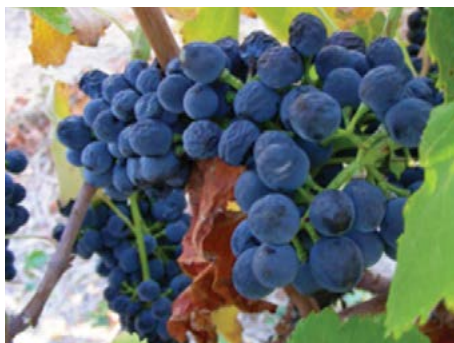
Figure 2. Untreated grapes showing symptoms of sunburn.

Temperatures higher than 28°C can both stress the vine and potentially affect the quality of the fruit. The worst damage occurs when cooler weather precedes high temperatures and the fruit has not acclimatised. The most efficient way to preserve the vineyard is to protect the fruit with Surround and prevent any unexpected exposure of fruit to intense heat and solar radiation. The Surround protective particle film layer can lower peak grape skin temperatures by as much as 8°C, with no negative effect on wine quality or fermentation. Consistent coverage with Surround can also lower vine temperature and thus reduce heat stress on the vineyard overall. Ultimately, this can contribute to a net increase in photosynthesis.