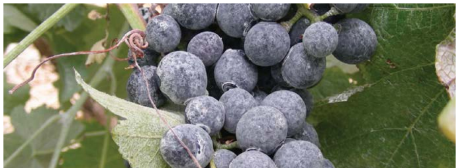
Figure 3. Grapes treated with Surround.