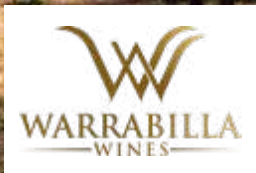
Figure 2. Warrabilla Wines vineyard

The information provided herein may include extracts from the product label and does not constitute the complete directions for use. READ THE PRODUCT LABEL THOROUGHLY BEFORE OPENING OR USING SURROUND