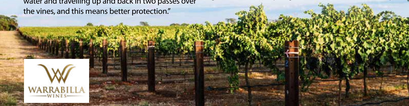
Figure 1. David Mitchell inspecting untreated vines at Warrabilla Wines vineyard

"The general health of the vine is a lot better, as the Surround is preventing sunburn which can easily cause up to 30% loss in production"