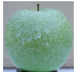
Apple needs re-application

Important: Always read the label before buying and follow label instructions when using this product.