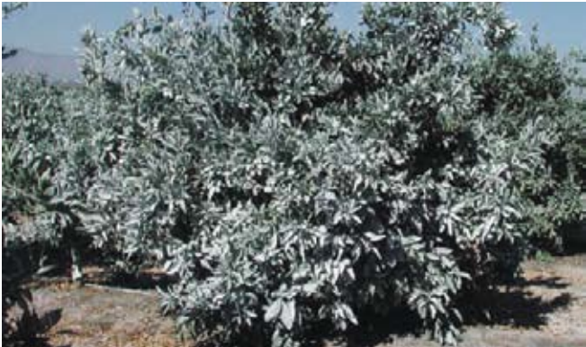
When coverage is maintained throughout the hot summer months, Surround® improves foliar flushes in young trees.

Offering all these qualities, Surround represents a real breakthrough in plant surface protection.