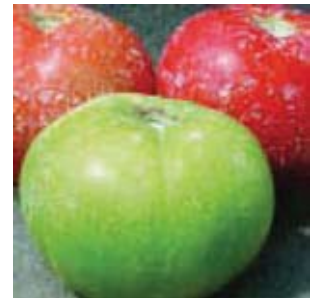
Fruit requiring re-treatment